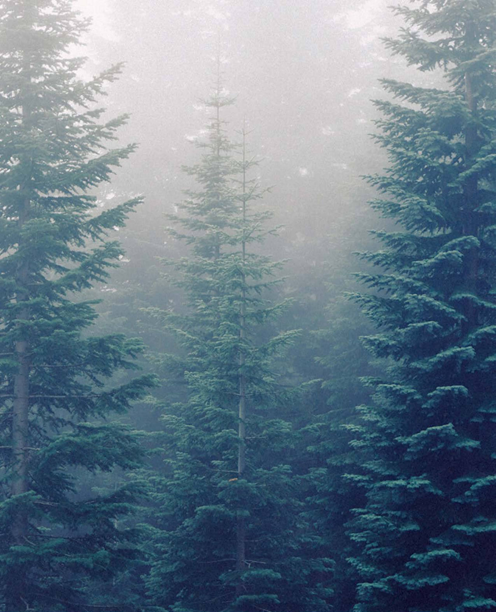
Village Gate House: Whiski Jack Resorts Whistler